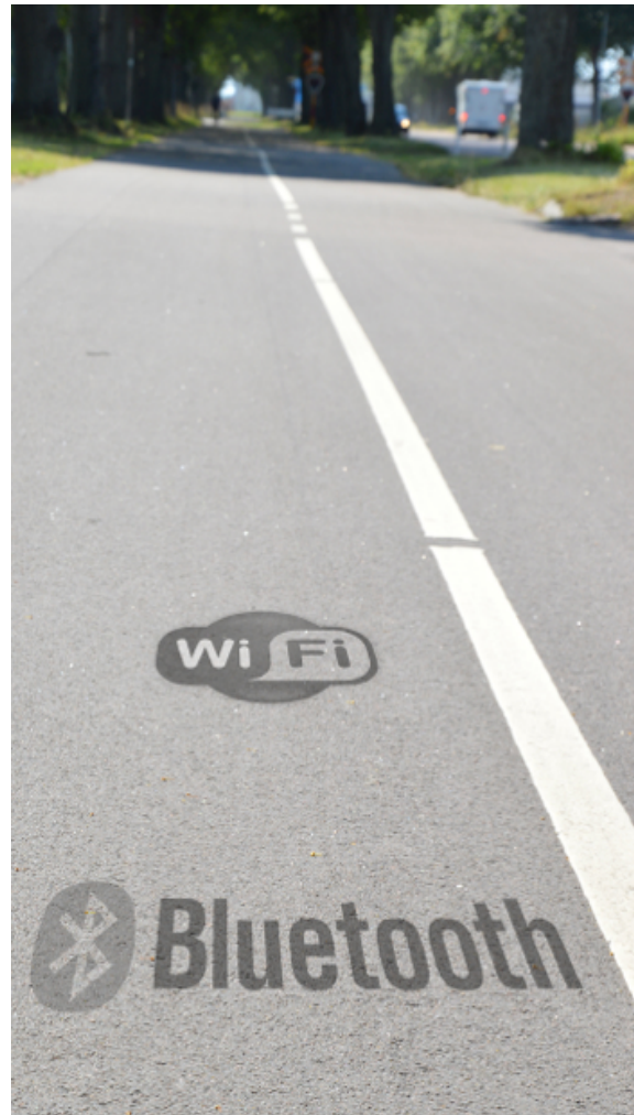
Figure 3: So which road should you choose? A good recommendation is to use a solution which supports several communication standards, allowing you to test your way to the best solution.

So which road should you choose? A good recommendation is to use a solution which supports several communication standards, allowing you to test your way to the best solution.